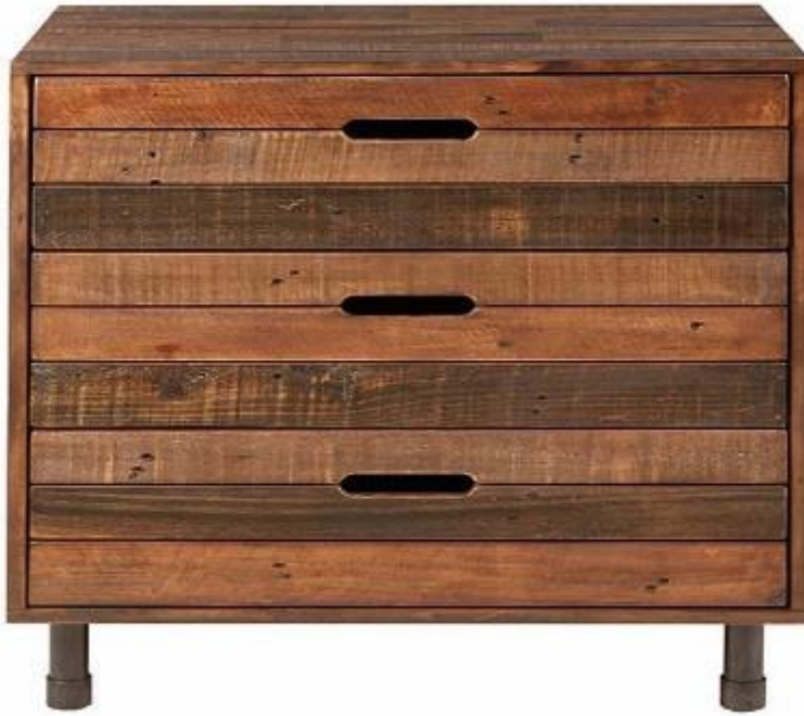
Recalled INK+IVY Renu three-drawer dresser