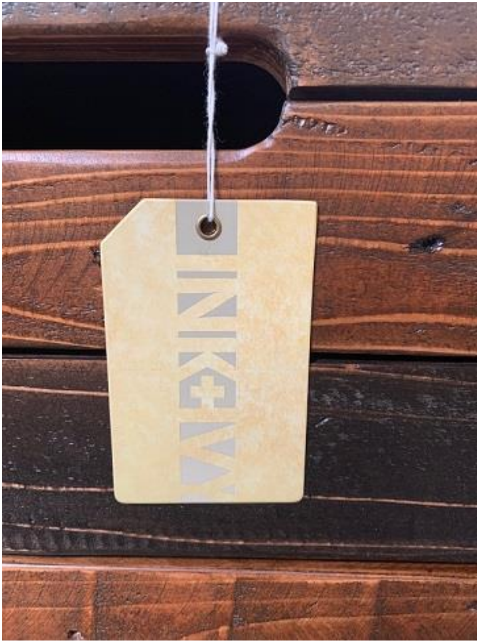
The INK+IVY brand is printed on a tag hanging from a dresser drawer